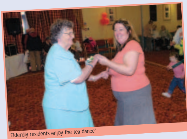
Elderly residents enjoy the tea dance"

Helena Housing staff were on hand to talk about our services and general issues.